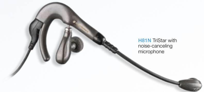
H81N TriStar with noise-canceling microphone

Get ultimate sound quality on traditional PBX phones, IP phones and wideband IP phones by combining your Plantronics TriStar headset with our latest corded amplifier—the Vista M22 with Clearline™ audio technology.