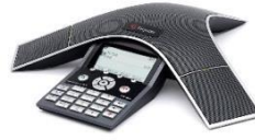
Polycom SoundStation Conference Phones