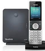
Yealink DECT Cordless